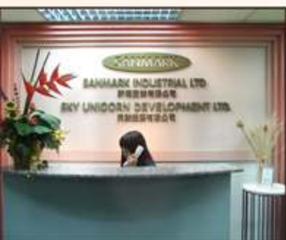
Hong Kong Head Office 香港總公司