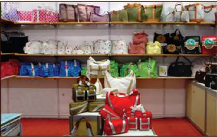
APLF-Fashion Access 亞太皮革展