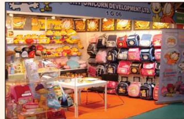
Summer Sourcing Show for Gifts, Houseware & Toys 香港夏季禮品、家庭用品及玩具展

We join exhibitions in Hong Kong and China every year. Our new products of bags, stationery and other accessories will be displayed regularly.