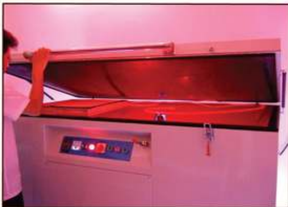
● Screen Making Machine 晒網箱