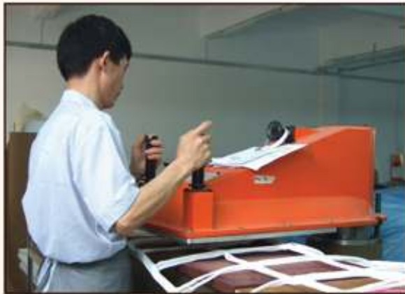
● Hydraulic Cutting Machine ( Small size ) 油壓啤機