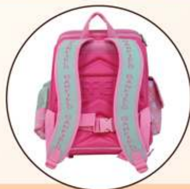
Healthy School Bag Collection 健康書包系列