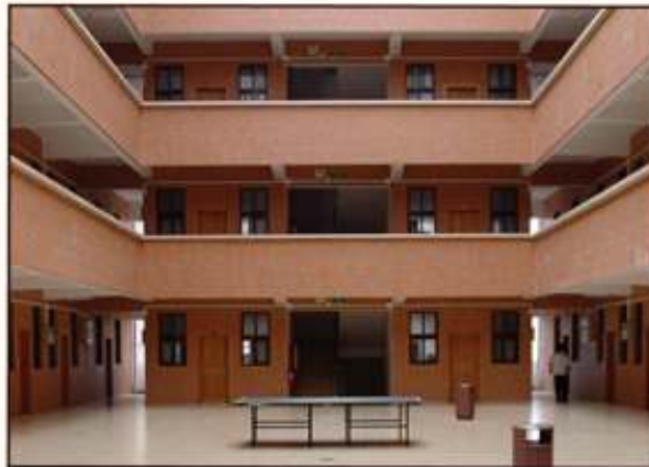
● Dormitory 員工宿舍