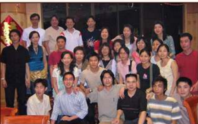
Company Gathering 公司聚會