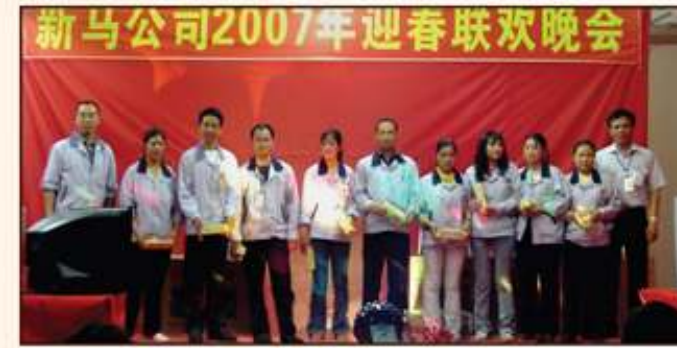
Annual Dinner 農曆新年晚會