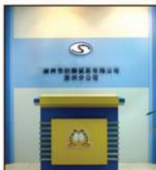
Guangzhou Branch Office 廣州分公司