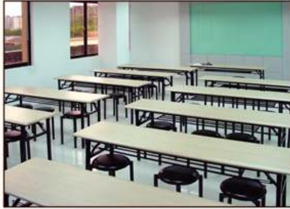
● Training Room 培訓室