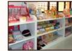
Show Room ( OEM & Open Items )