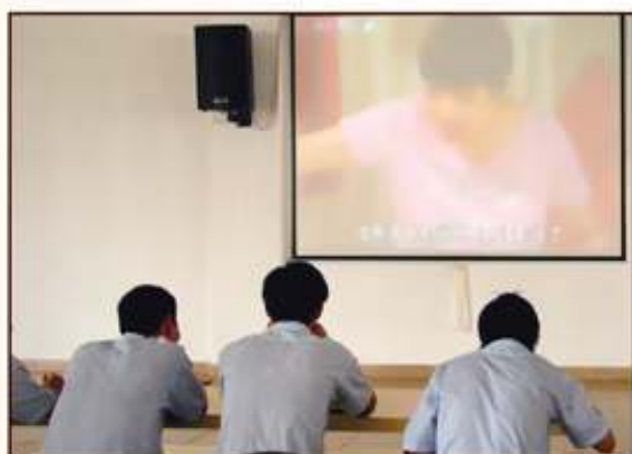
● TV, DVD, Karaoke with projector-screen 娛樂時間