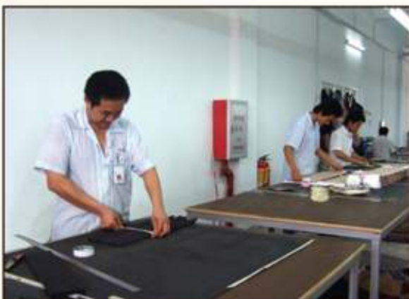
● Cutting by hand 人工開料