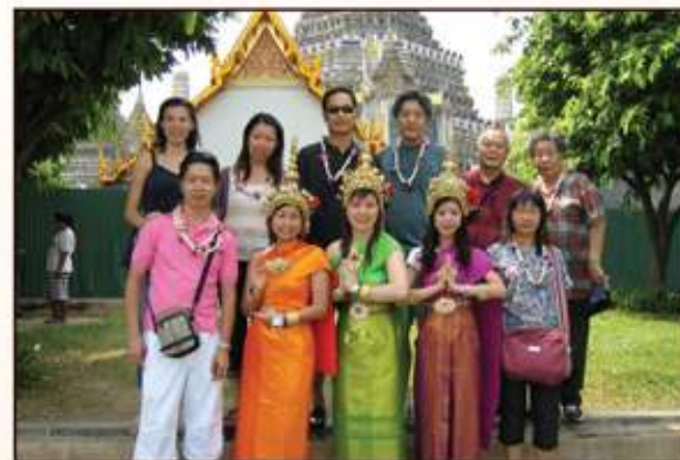
Thailand Company Trip 泰國之旅