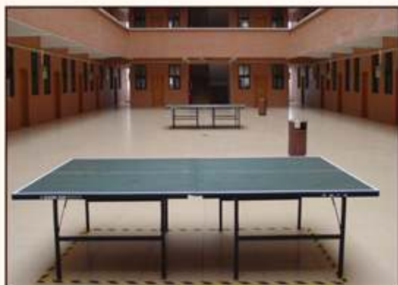
● Table Tennis 乒乓球