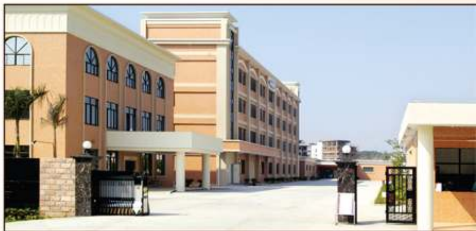
Huizhou Office and Factory 惠州公司及廠房