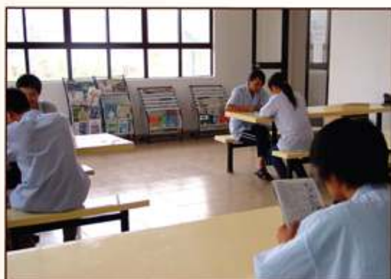
● Reading / Chess Room 閱讀室 / 娛樂室