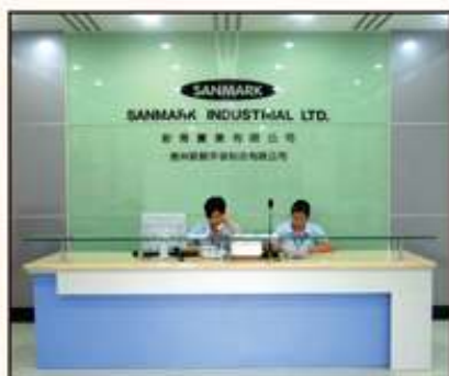
Huizhou Office 惠州公司