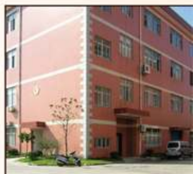
Shanghai Branch Office 上海分公司