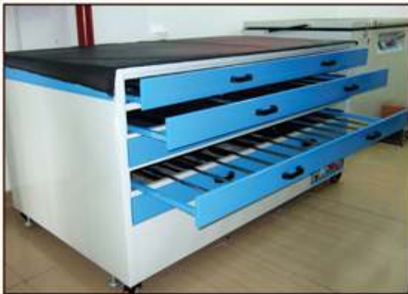
● Screen Drying Machine 烘乾機