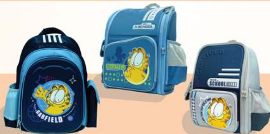
Healthy School Bag Collection 健康書包系列