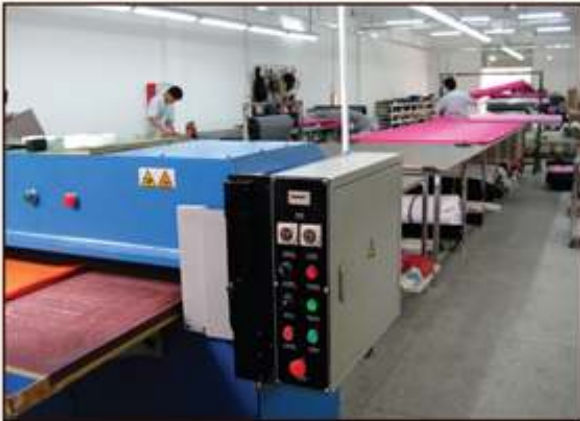
● Hydraulic Cutting Machine 大油壓啤機