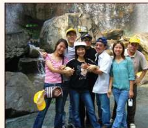
Company Trips 公司旅行