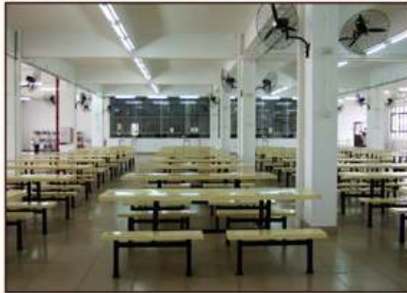
● Dining Hall 飯堂