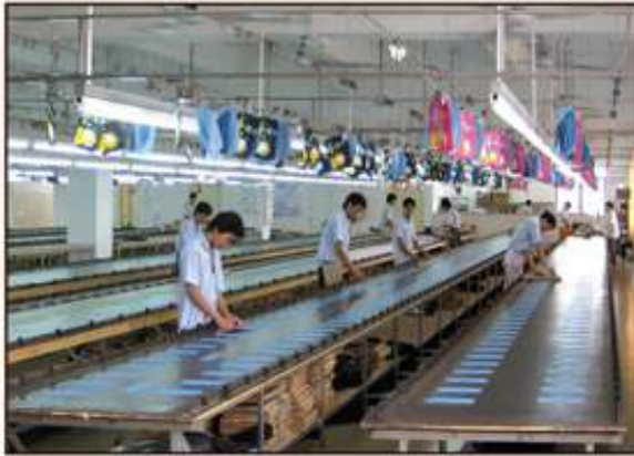
● Printing Table 絲印長桌