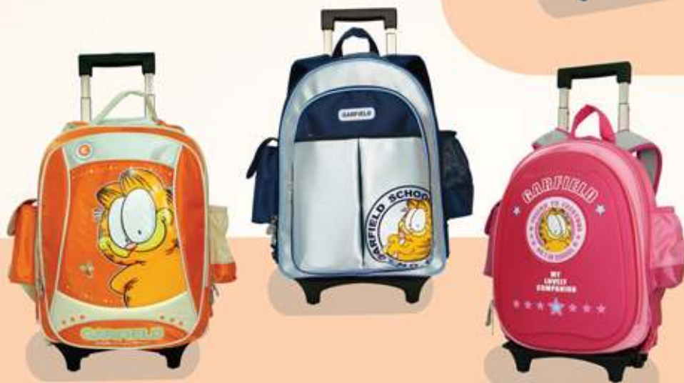
Detachable Trolley 可拆除拉桿系列