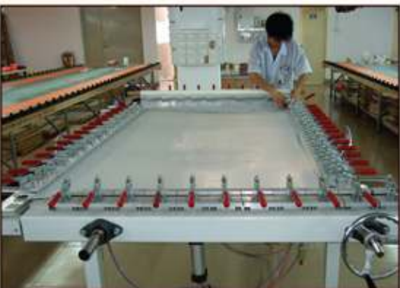
● Screen Making Machine 拉網機