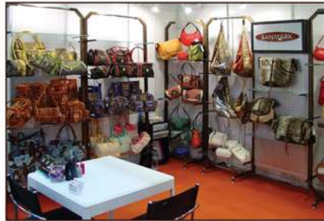
APLF-Fashion Access 亞太皮革展