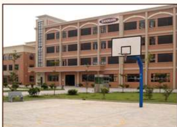
● Basketball Court 籃球場