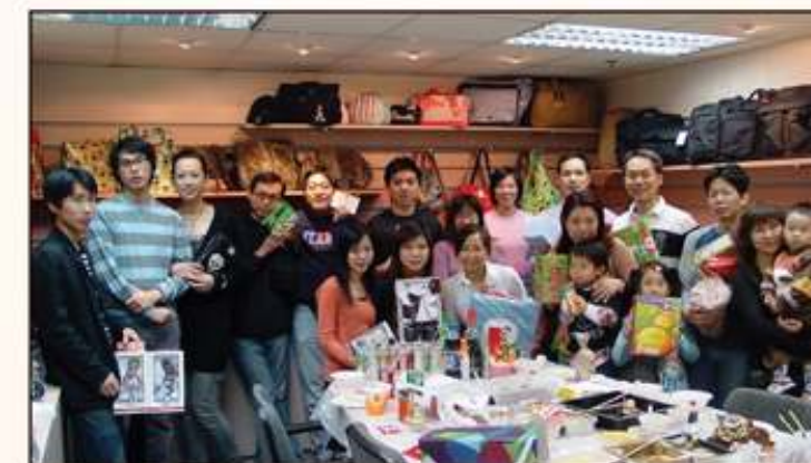
Christmas Party 公司聖誕節慶聯歡會

Celebrations together with our staff and their families during Christmas and New Year.