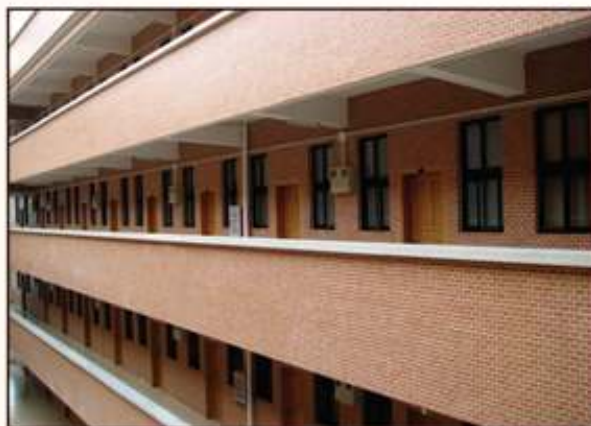
● Dormitory 員工宿舍