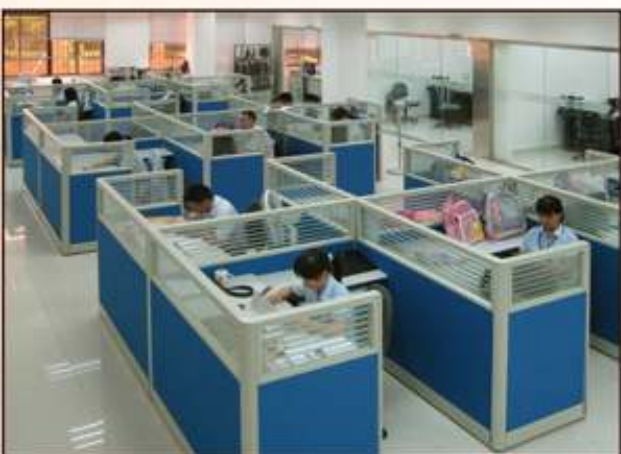
Huizhou Office 惠州辦公室